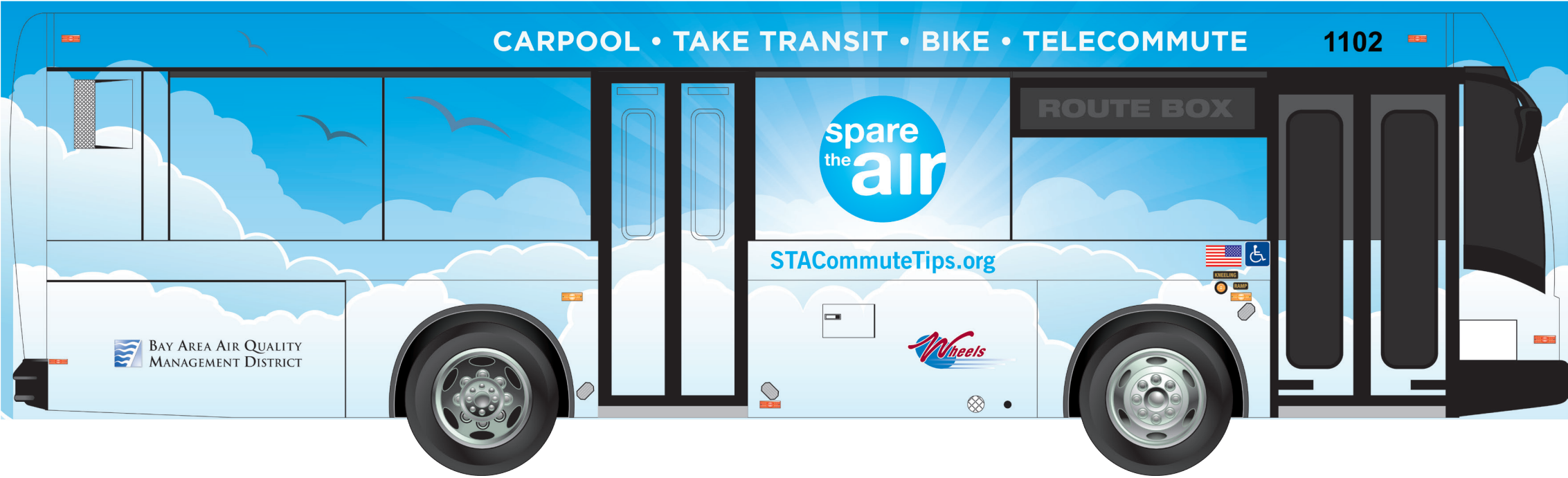
TriValley .30' LF Gillig Hybrid '11 | Wednesday, June 15 2016 20:37:25 SS Full Side