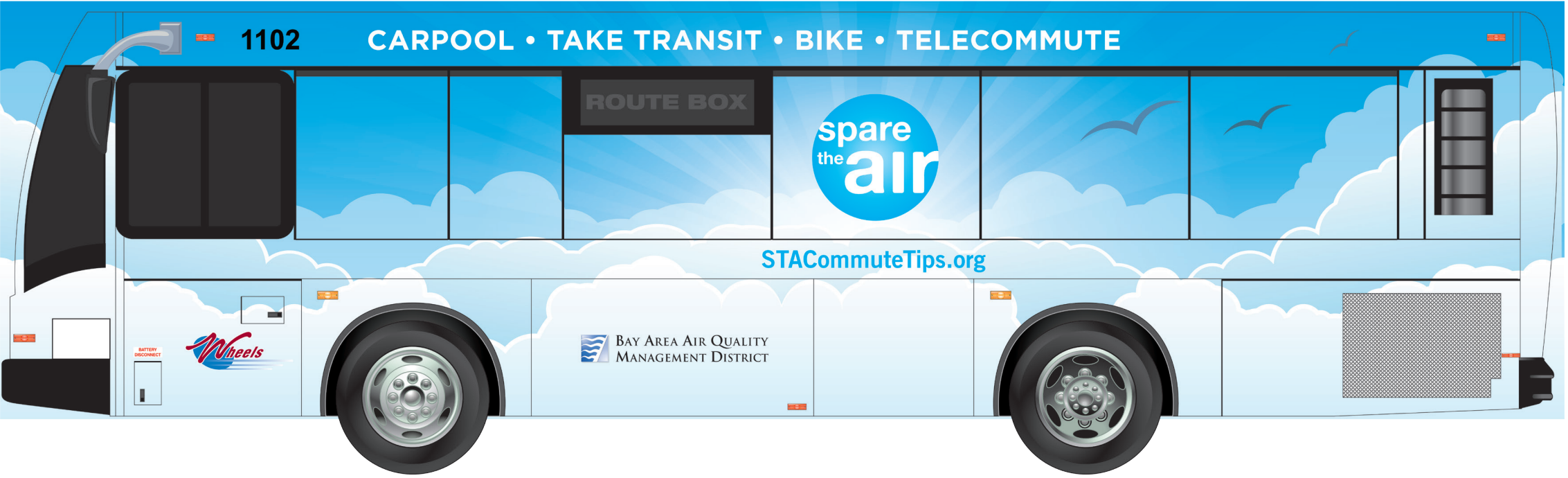
TriValley .30' LF Gillig Hybrid '11 | Wednesday, June 15 2016 20:35:37 BK Full Back