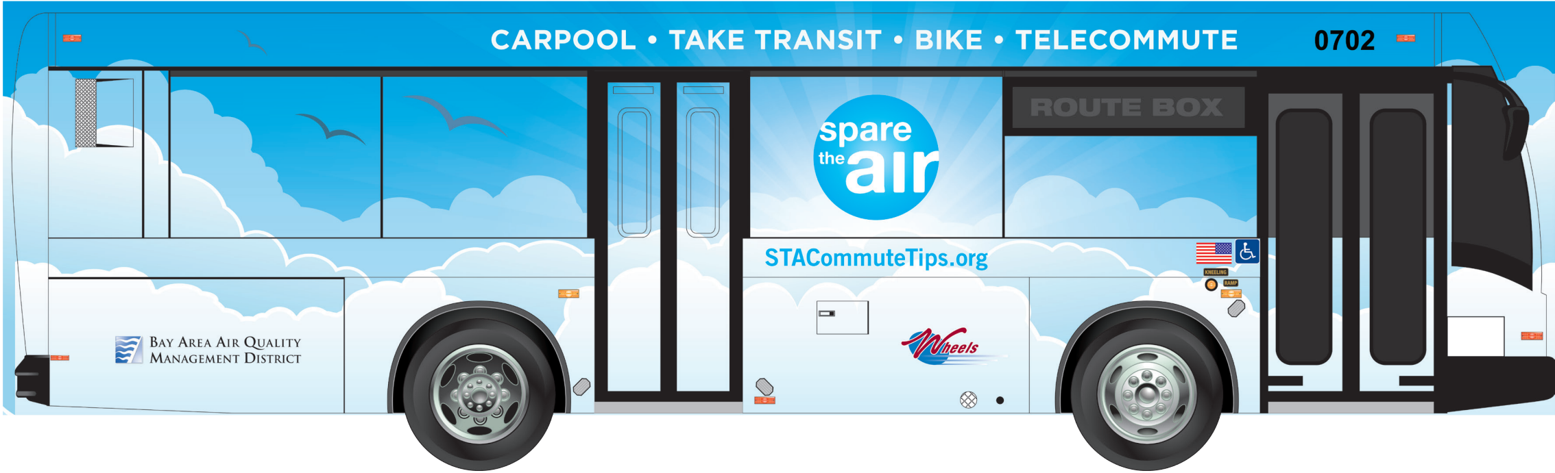
TriValley_30' LF Gillig Hybrid '11 | Wednesday, June 15 2016 20:37:25 SS Full Side