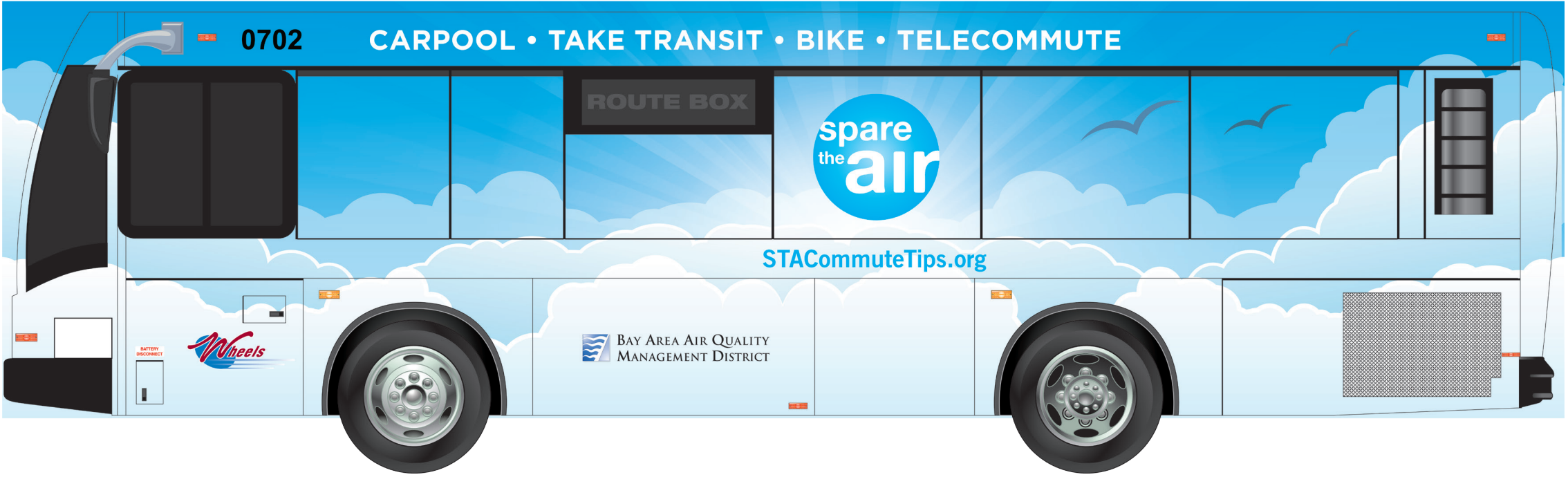
TriValley_30' LF Gillig Hybrid '11 | Wednesday, June 15 2016 20:35:37 BK Full Back