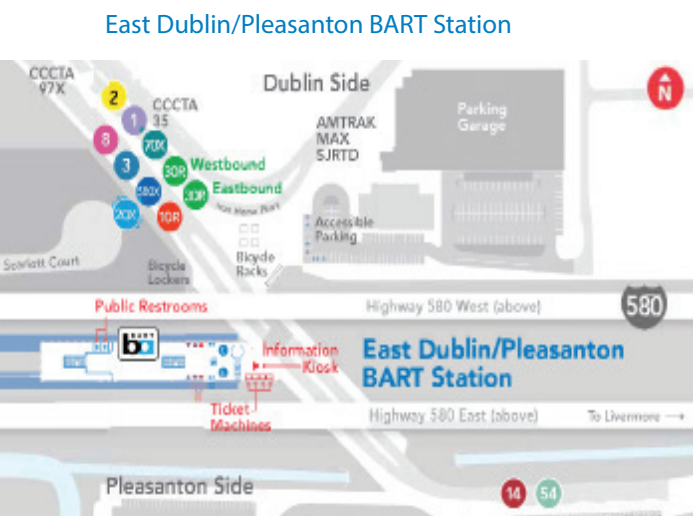
East Dublin/Pleasanton BART Station